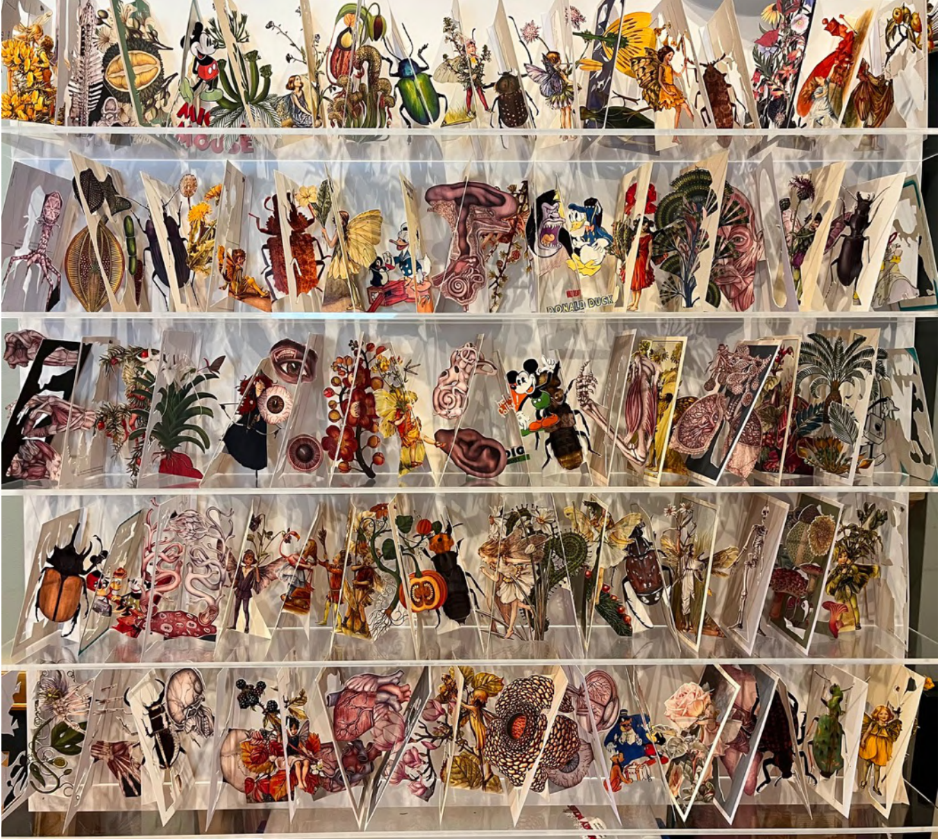
House of Cards I , 2021 , Cut postcard construction, 93 x 101 x 14 cm, £18,000