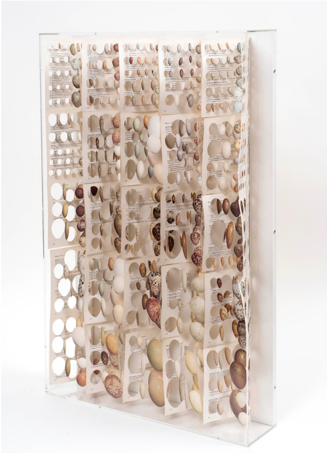
The Collector, 2012 cut book page construction, 99 x 61 x 13cm, £13,500