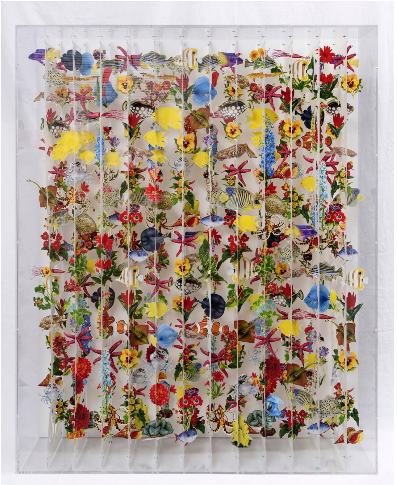
Fish and Flowers, 2021

inkjet print on paper 125 x 105 x 25 cm (installed + detail), £20,000