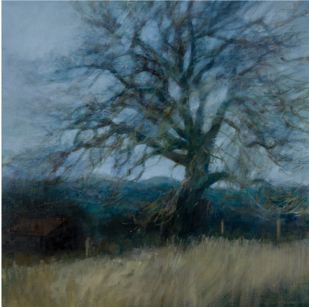
The Big Ash , 2023 oil on linen, 46 x 46cm, £2,500