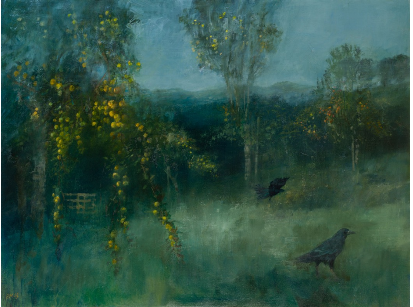
Crows in the September Orchard , 2019 oil on linen 30 x 40 ins/ 76 x 102 cm, £5,500