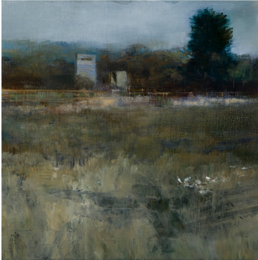
Newtown Bird Hide , 2022 oil on linen, 30 x 30cm, £1,900