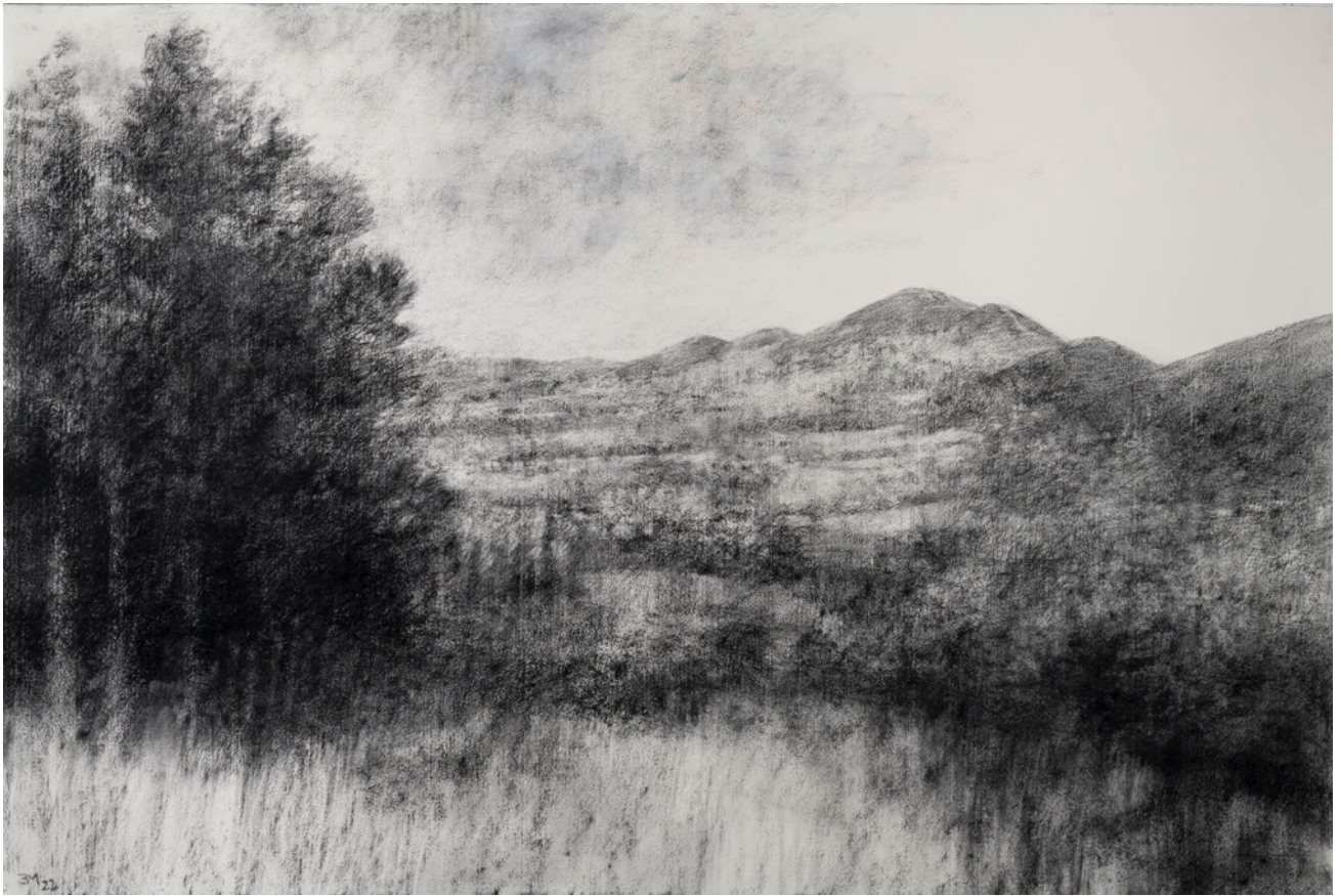
The Beautiful View , 2022 charcoal on paper 32 x 48 ins/ 81 x 122cm, £5,000