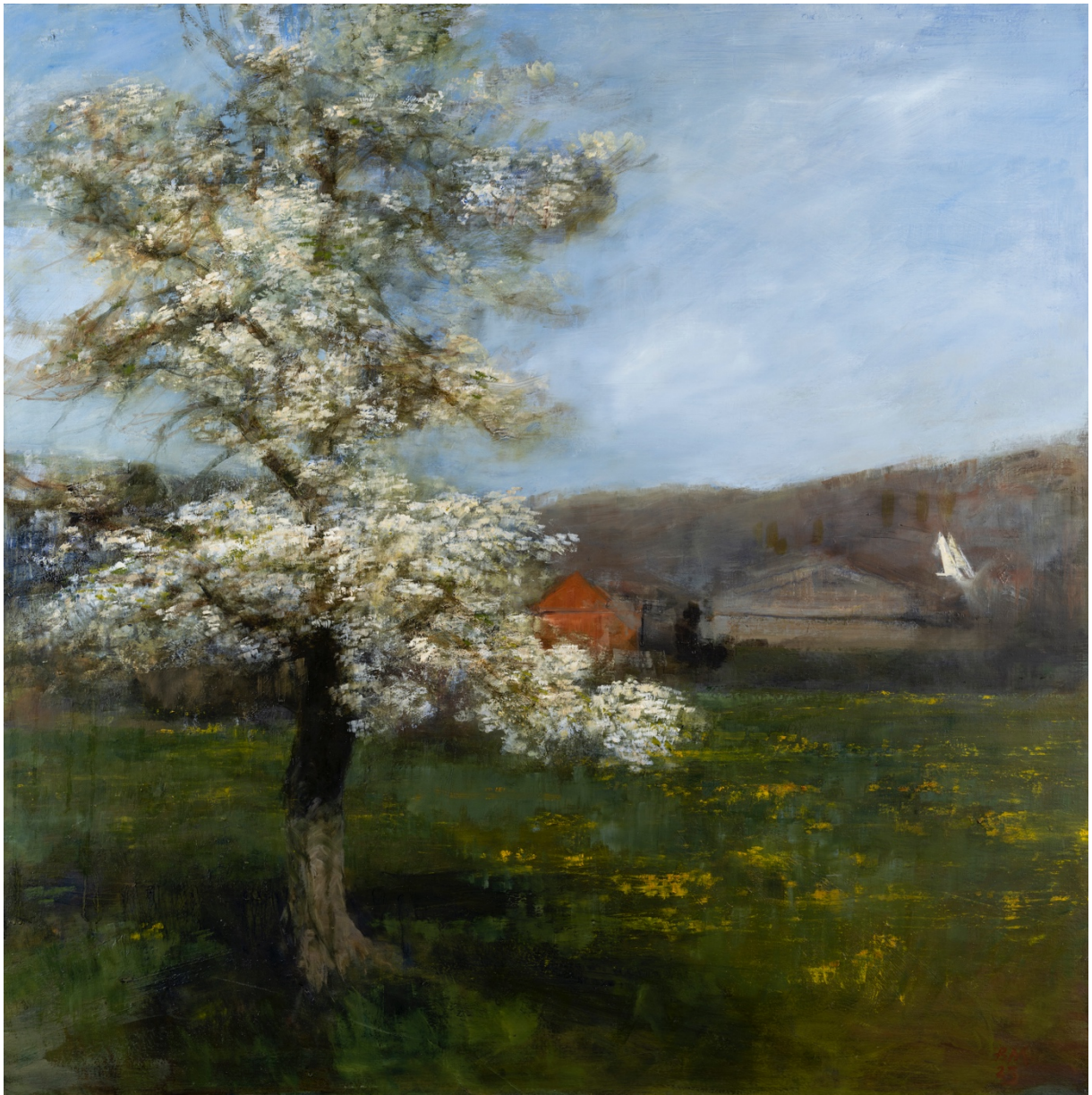
Perry Pear at Storridge, 2023 oil on linen, 40 x 40 ins / 102 x 102cm, £5,500