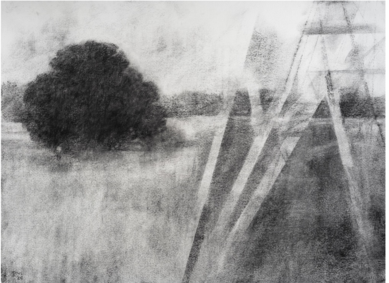
The Battlefield Oak , 2024 charcoal on paper approx 22 x 30 ins/ 56 x 76cm, £3,500