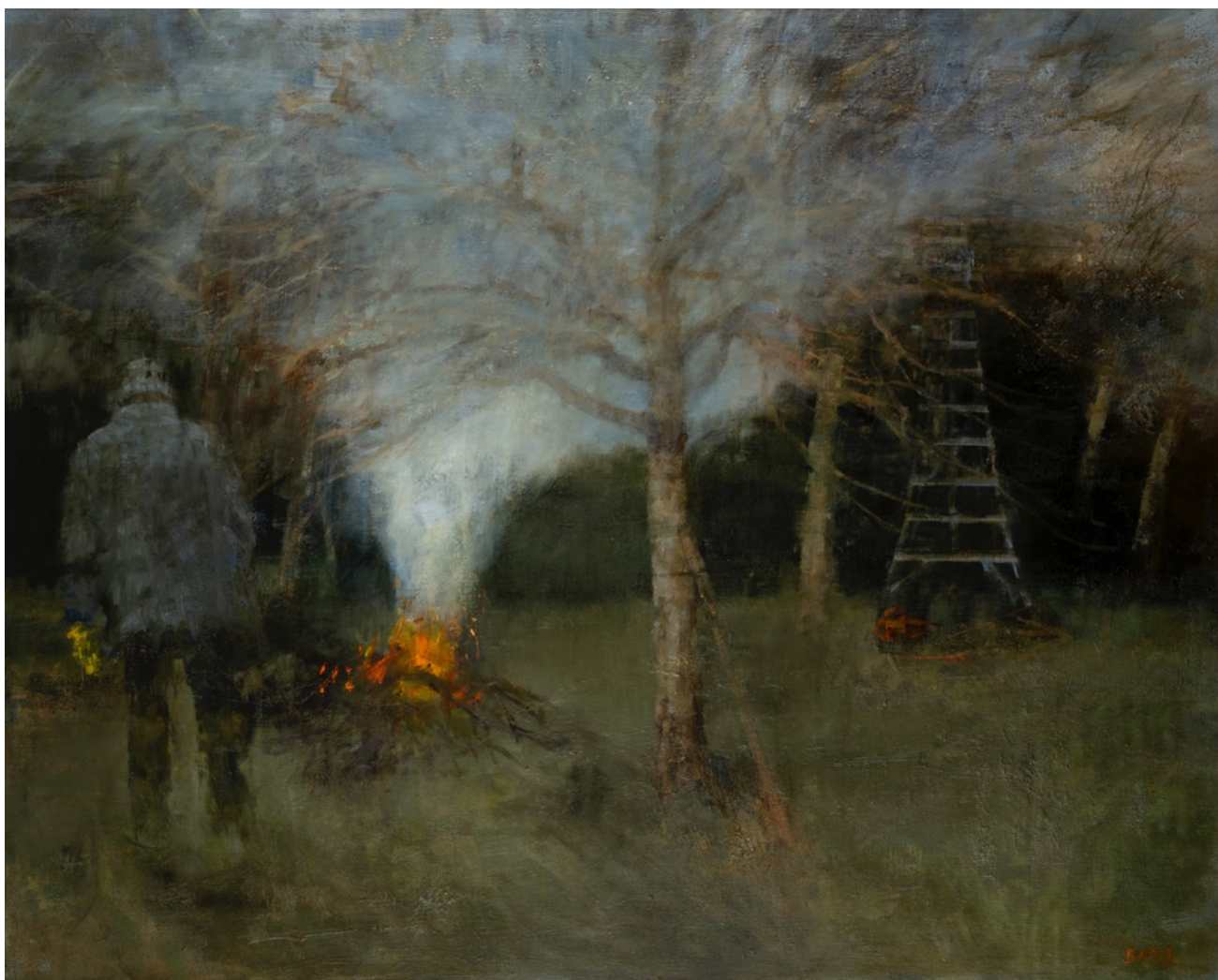
March Pruning with the Japanese Ladder, 2023 oil on linen, 40 x 50 ins/ 101 x 127cm, £5,500