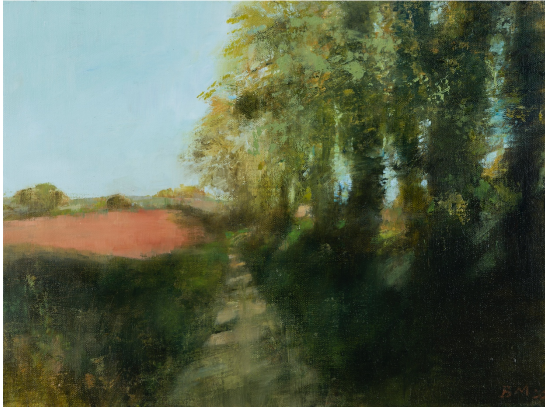
Herefordshire Lane (Red Earth) , 2020 oil on linen, 12 x 16 ins/ 30 x 41cm, £2,250