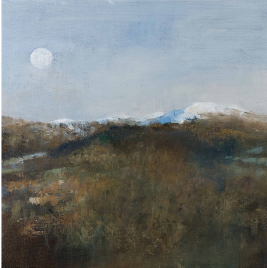
January Moon , 2022 oil on linen, 30 x 30cm, £1,900