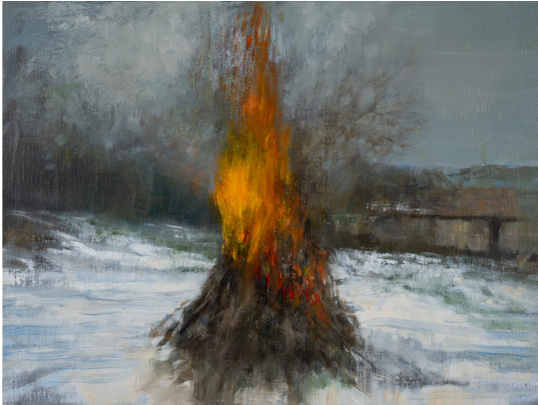
Easter Fire, 2020 oil on linen, 12 x 16 ins/ 30.5 x 40.5cm, £2,250