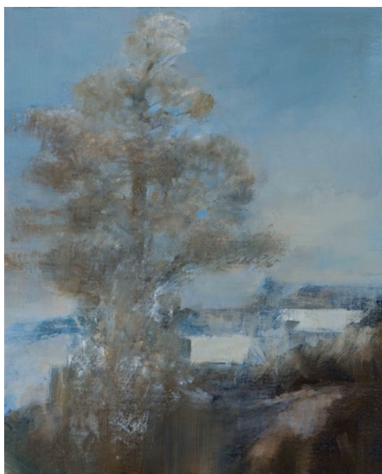
Frosted Field Maple, 2021 oil on linen, 30 x 25cm, £1,750

The drawing The Midsummer Mare II came out of a chance encounter some years ago with a beautiful grey mare in the country below the Malverns on the evening of the Summer Solstice. Other drawings include the view to the hills from the orchard and the Severn water meadows where the Battle of Worcester was fought in September 1651."