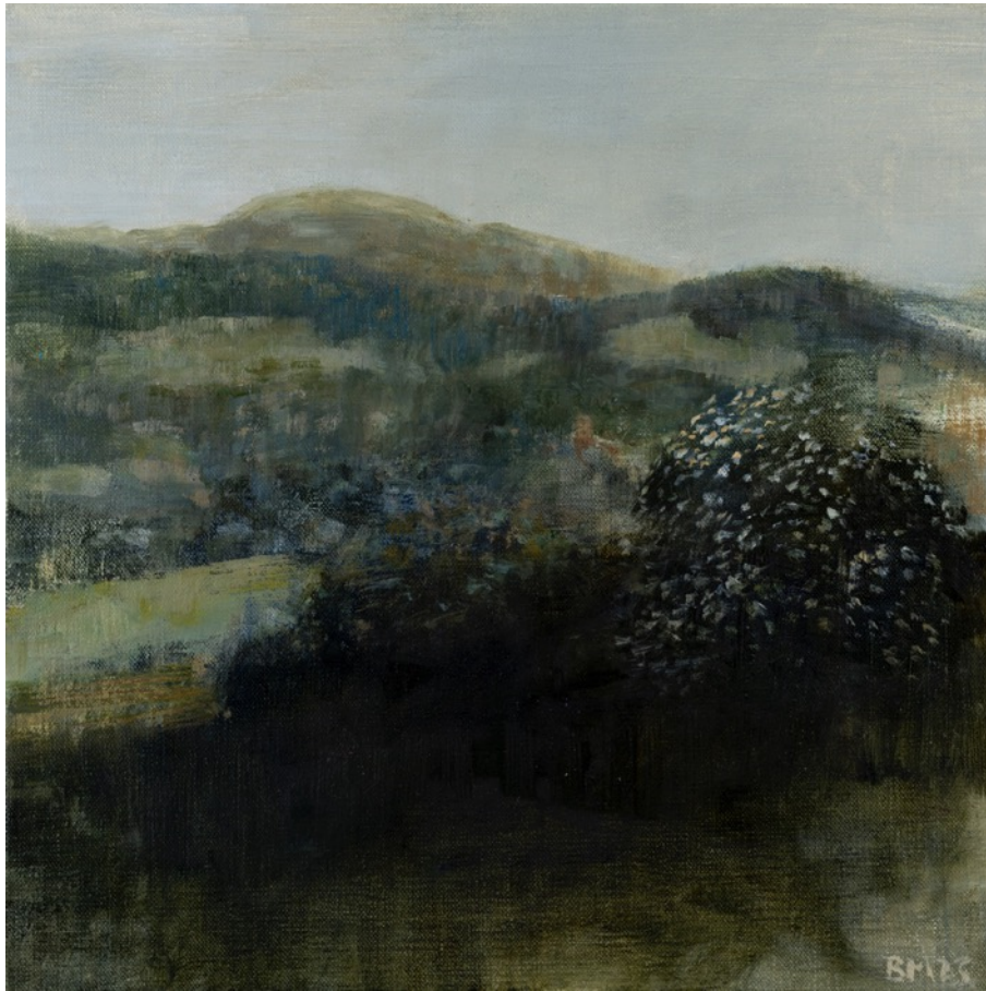
The Worcester Beacon in June, 2022 oil on linen, 30 x 30cm, £1,900