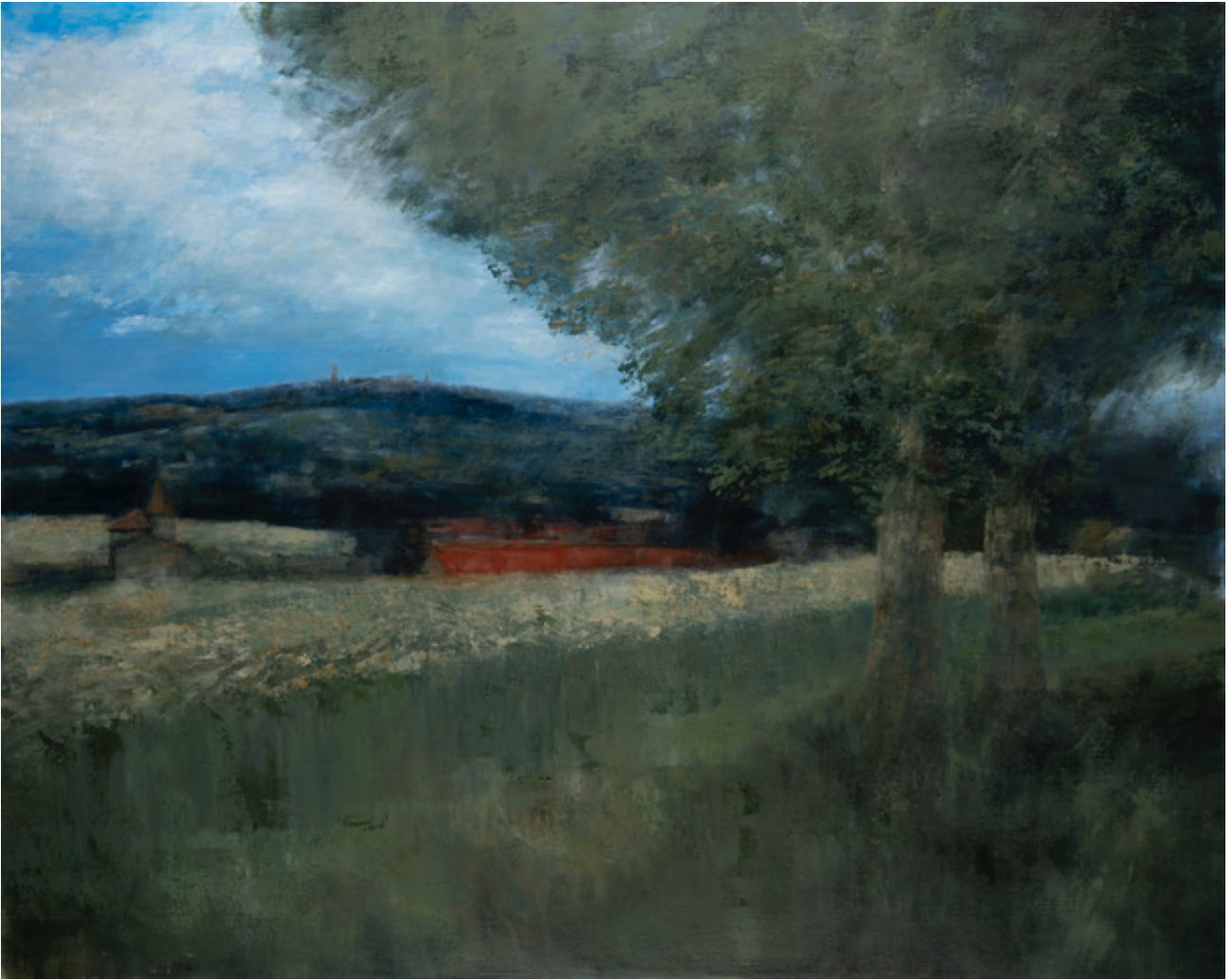
Gascony Pastoral, 2023 oil on linen, 40 x 50 ins/101 x 127 cm, £5,500