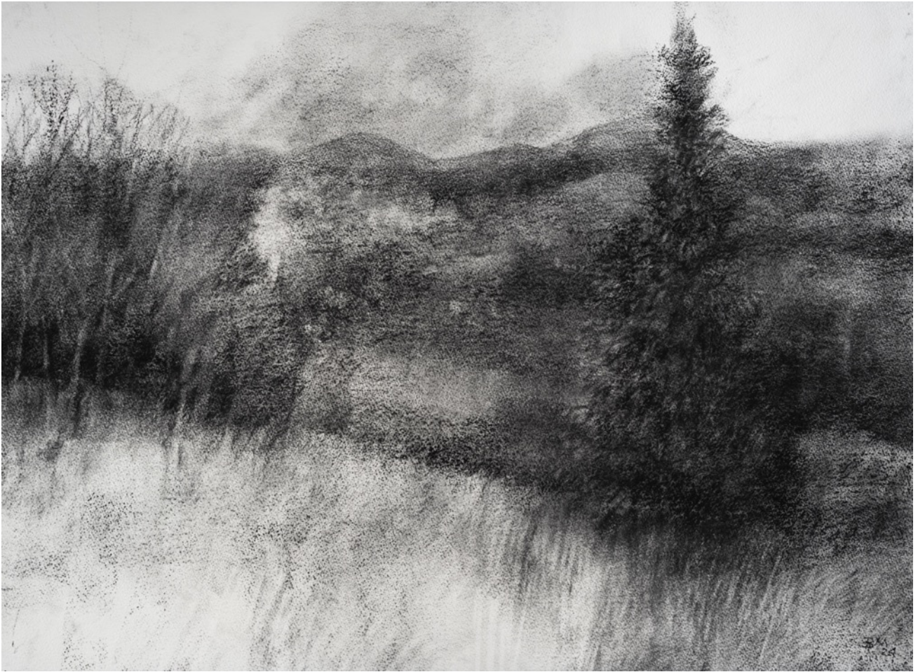
Spruce and Smoke, 2024 charcoal on paper approx 22 x 30 ins/ 56 x 76cm, £3,500