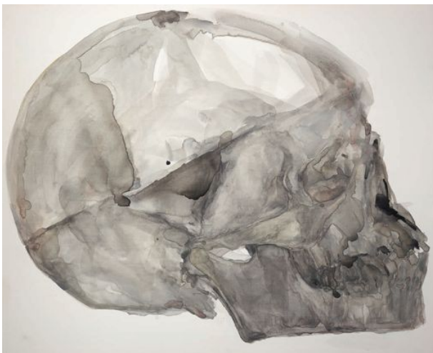
Illustrated: Lucid Stillness / Os